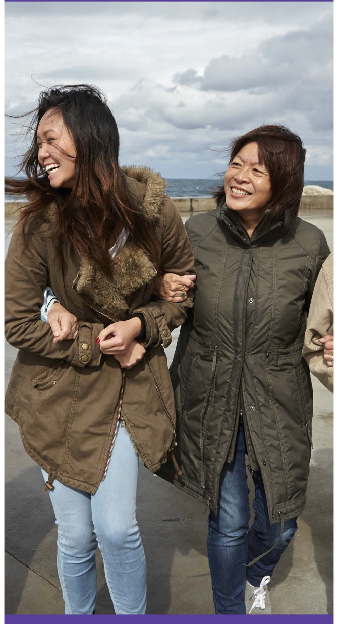
TALK TO YOUR HEALTHCARE PROVIDER TODAY ABOUT CERVICAL SCREENING.